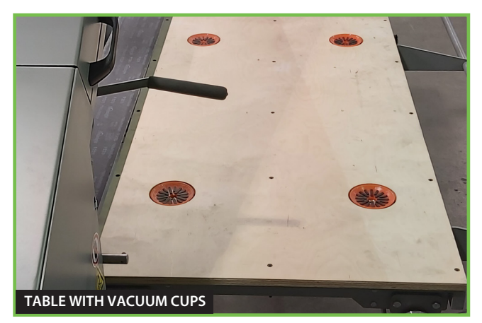
Improve hold down on metal sheets

Remove weld seam and obtain grinding more quickly