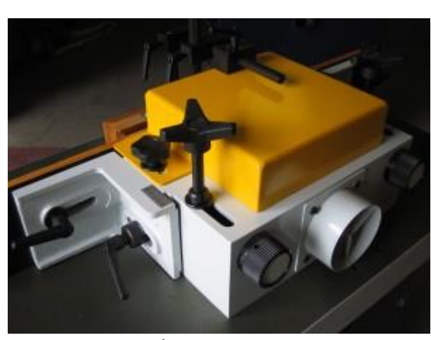
Reverse Tilt (overall adjustment plus 5 degrees to minus 45 degrees)

Unlike the majority of manufacturers, the SM255t is designed with a backward tilting spindle. Working from underneath the stock makes for safer working, without restriction on the size of stock being machined, and without obstruction to the pressure guards or power feed. Wood chips are directed into the exhaust outlet in the machine base.