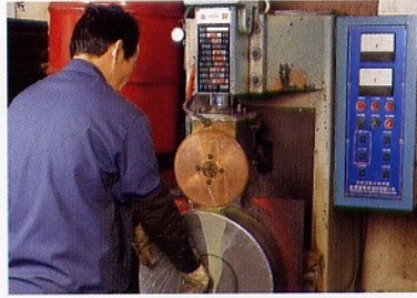
The blower casing is welded by a seam welding machine to ensure uniform welding result and a smooth welding surface.