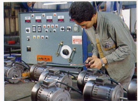
Motor performance test for current, voltage, and resistance.