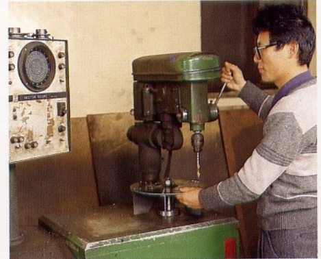
Blower fan balance test to ensure long service life of bearings, vibration free running and steady air flow.