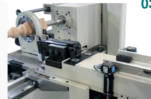
Finishing and roughing CNC copiers turning a table leg with a round steady of 140 mm.