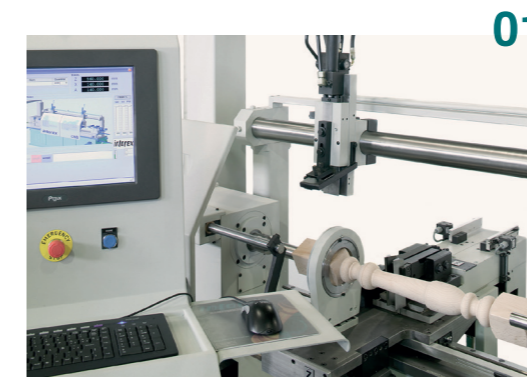
Standard machine: 2 CNC copiers, centering unit and 2 automatic back knife units.